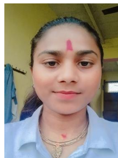
Neha Saini Fine Arts & Painting